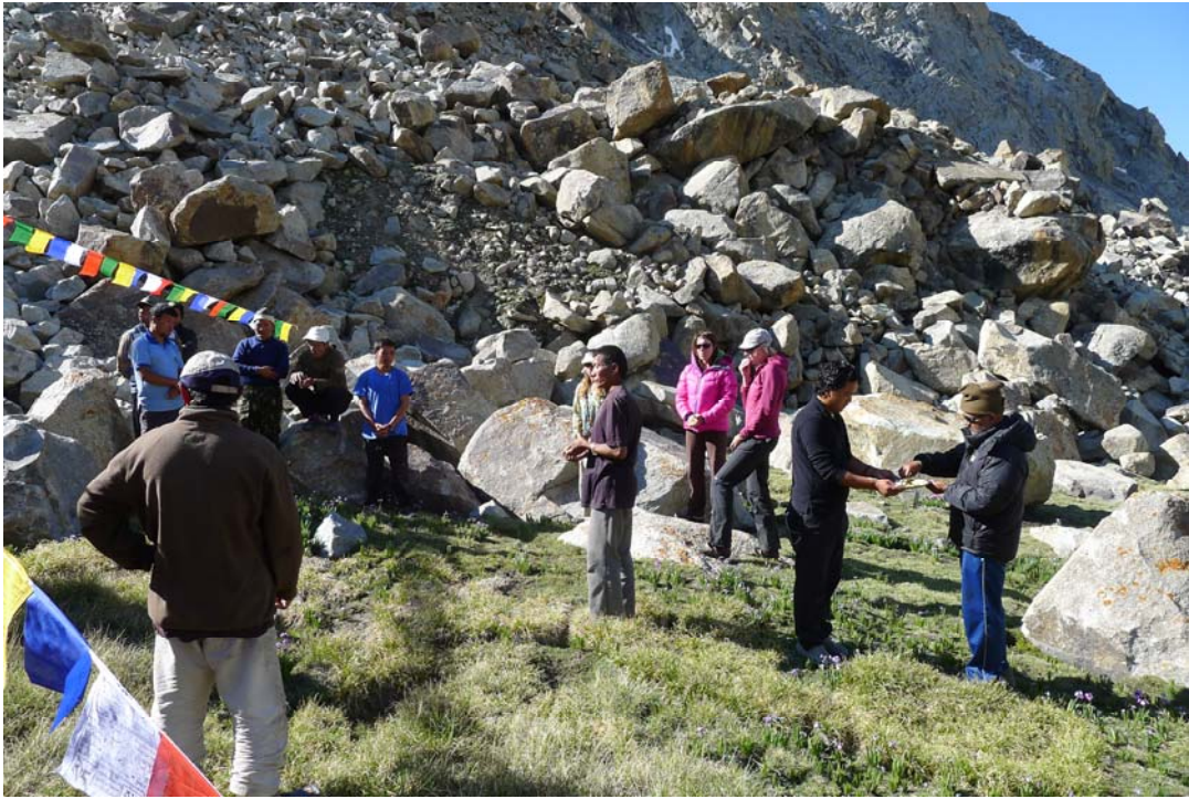
Our Indian team at Base Camp performing the “Puja” ceremony.