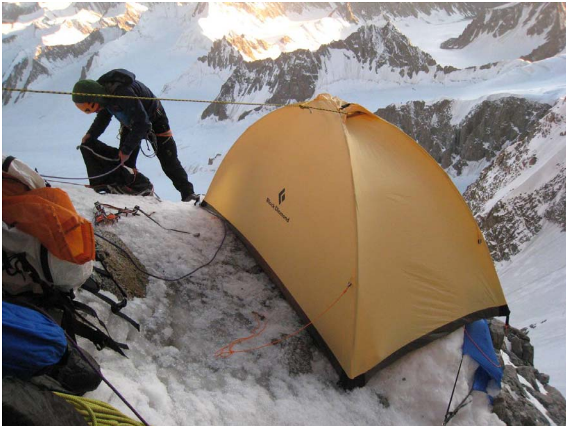
Camp 2... just barely, at ca 6,700 m on SKII